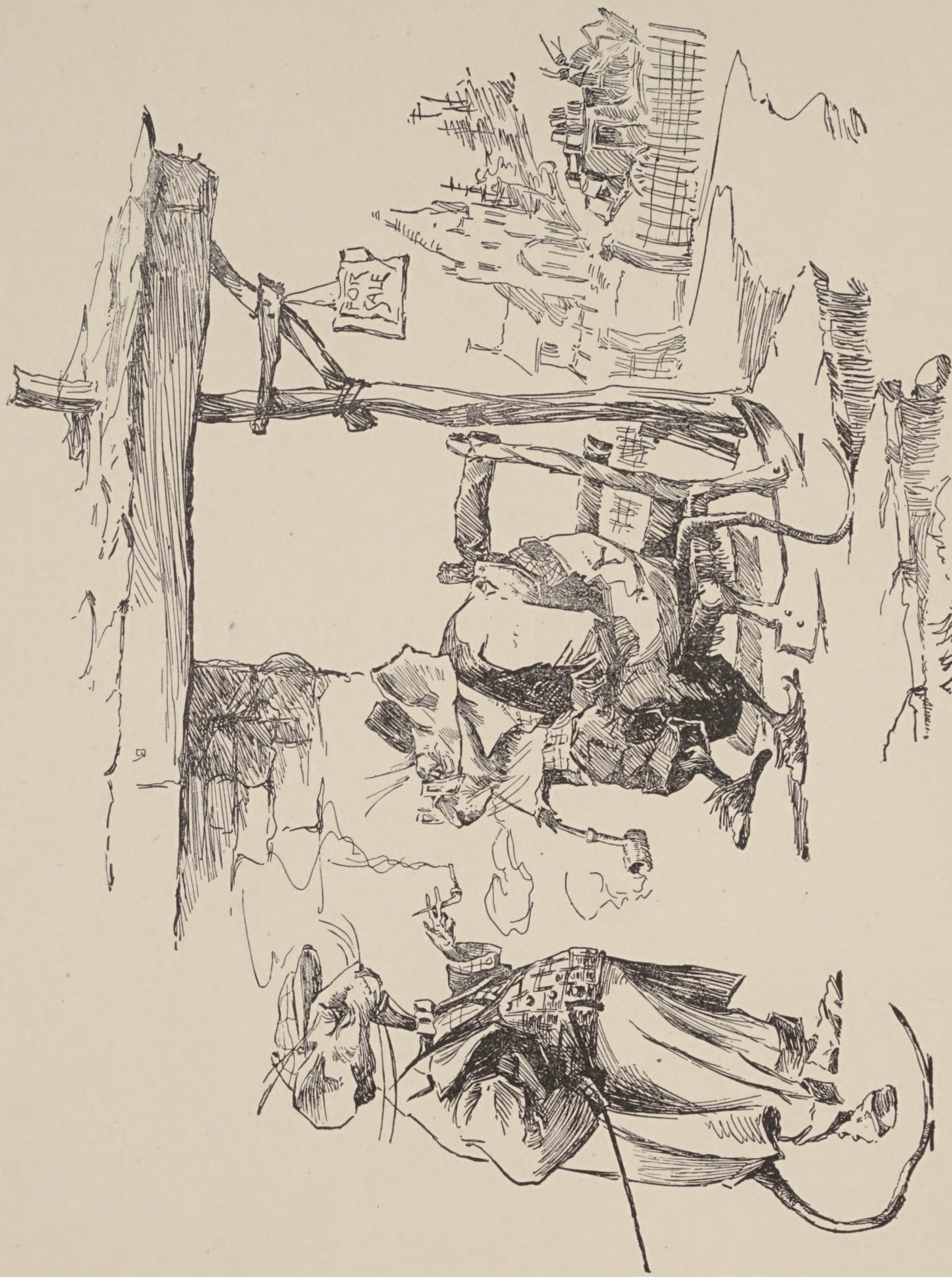
CHURCH MOUSE WALKS UP AND DOWN.